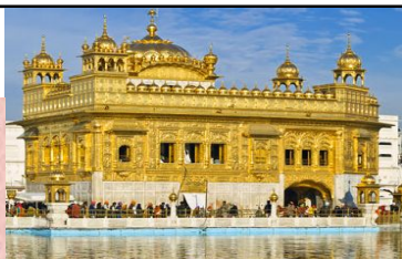
The Five K's.